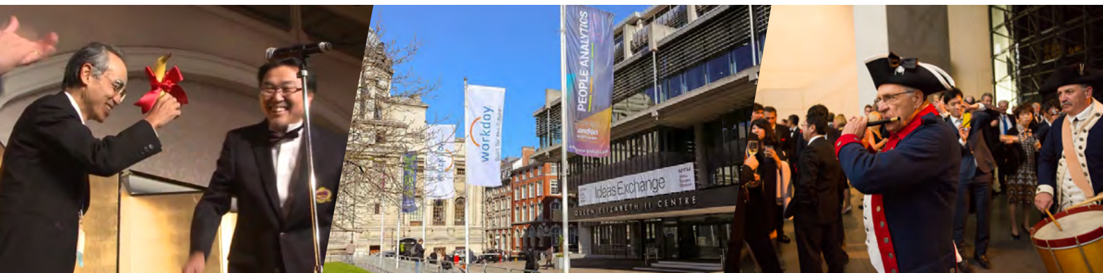
ISTA 2014 Kyoto Gala Dinner