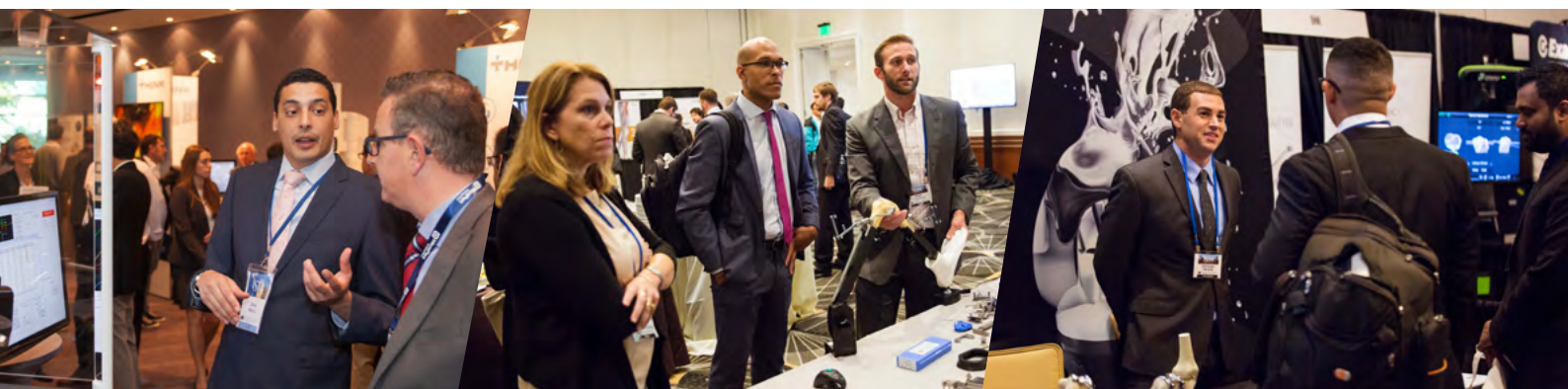
ISTA 2015 Vienna Exhibition