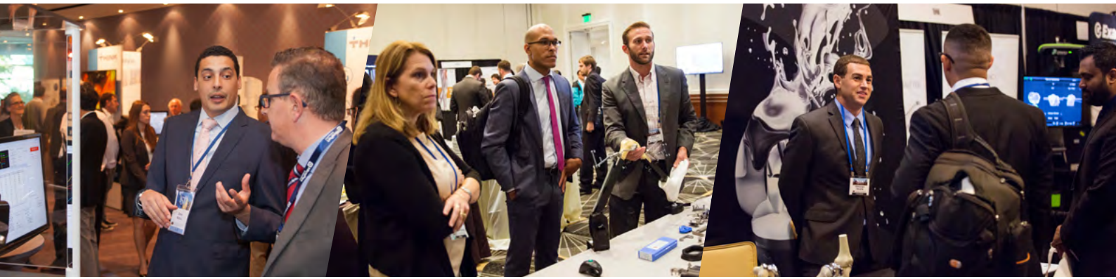
ISTA 2015 Vienna Exhibition